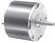
FIG. A D1071