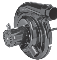
FIG. C A173