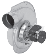
FIG. B A172