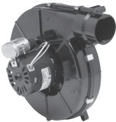
FIG. A A171